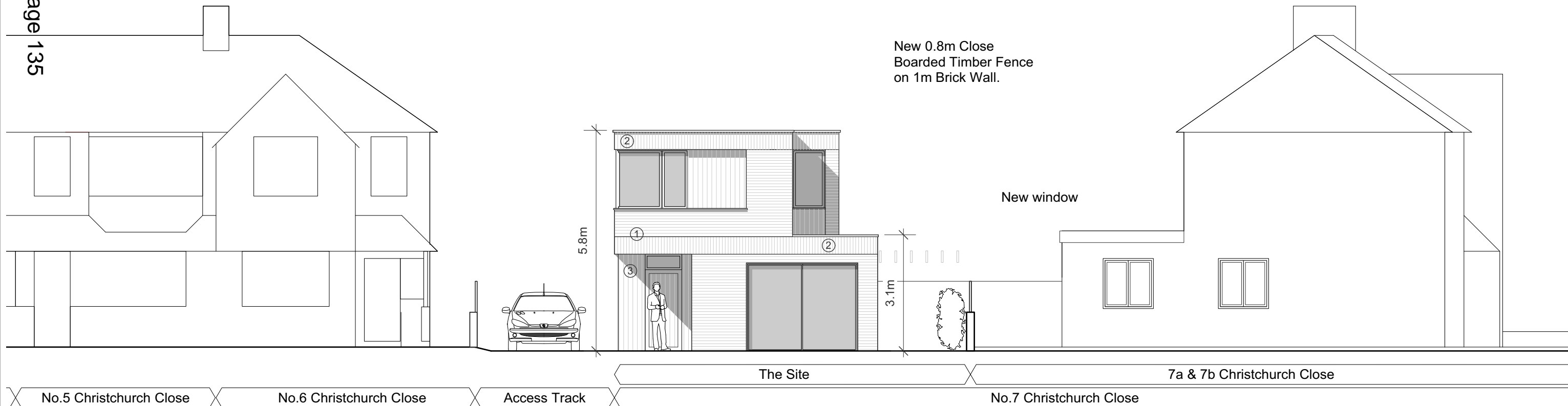
2 South Elevation Scale: 1:100